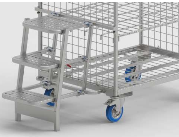
OPTIONAL LADDER KIT